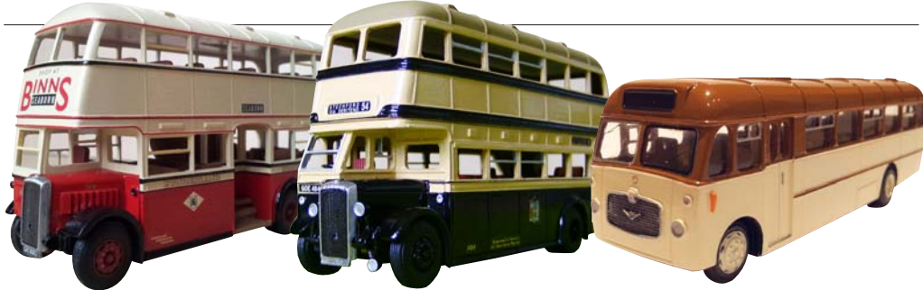
MMK032D - Daimler MMK032L - Leyland Roe Pre-War Centre