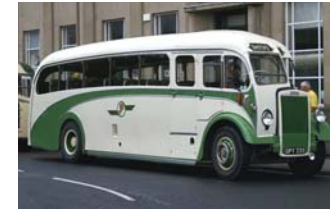
MMK054 - 1947 Plaxton C33F Leyland PS1 Coach