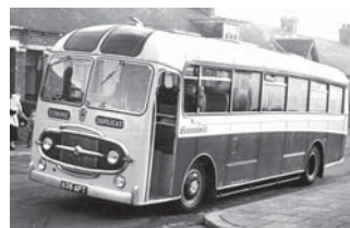
MMK056 - 1958 Plaxton Consort C41F Coach