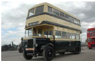
MMK042 - 1937-40 Birmingham Standard Pre-War Daimler