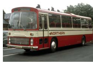
MMK044 - 1972 ECW Bristol RELH Coach/Grant Door