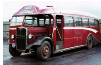
MMK050 - 1946 Duple C-Type AEC Regal I