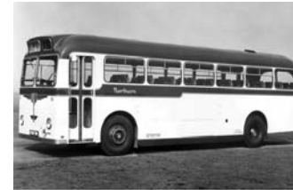
MMK045 - 1956 Willowbrook DP41F AEC Reliance