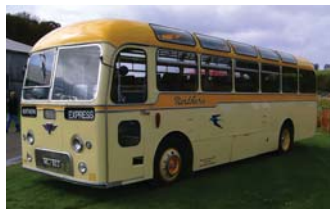
MMK041 - 1962 Alexander BET Style 31ft AEC/Leyland