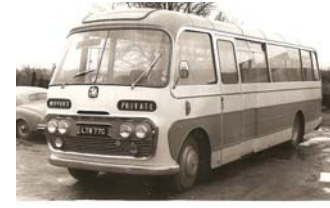
MMK048 - 1967/68 Plaxton Embassy IV Bedford SB