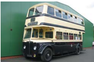
MMK043 - 1951-55 Birmingham Standard 27ft 'New Look'