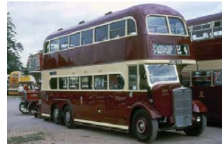
MMK047 - 1939 Northern Counties AEC Renown