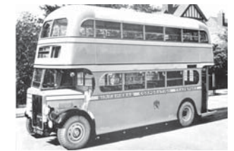
MMK046 - 1938 Northern Counties (A) AEC (L) Leyland