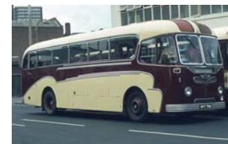
MMK051 - 1958 Roe Dalesman C41C Coach