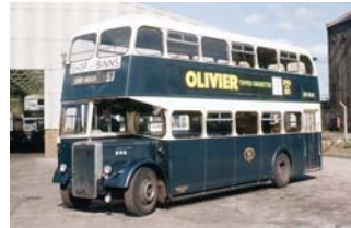
MMK053 - 1958 Burlingham H73RD Leyland PD3