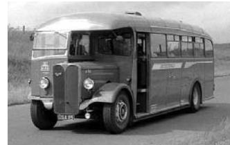
MMK055 - 1947 Brush C30F AEC Regal I