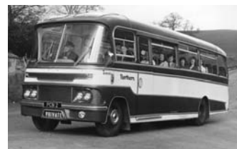
MMK052 - 1963 Harrington Crusader C41C Bedford SB