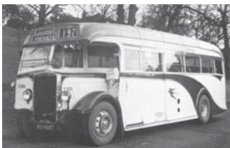
MMK039 - 1937 Alexander Leyland TS7 Coronation