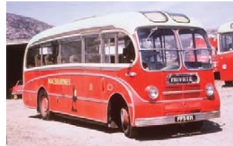
MMK049 - Burlingham 'Baby Seagull' Bedford OB