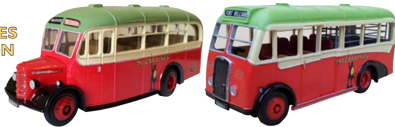
DU02BF Duple C25F / C20F Bedford OLAZ