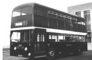
MMK040 - 1958-62 Alexander Atlantean PDR I