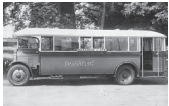
MMK030 - Albion PM28 (Bodywork TBA)