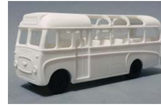
MMK068 - Duple Bedford VAS MacBraynes Deep Windows