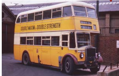
MMK605 - 1:50 Scale 1948 Leyland H56R Leyland PD2