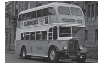
MMK078 - Massey Low Bridge (A) AEC Regent, (D) Daimler Expo