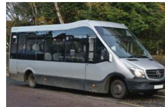
MMK076 - Mellor Strata Mercedes Sprinter Minibus