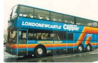
MMK072 - MCW Metroliner 6 Wheel Double Deck Coach