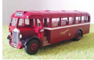
MMK023 - Utility Bodied Albion Valkyrie (Re-Run)