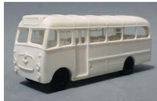
MMK062 - 1961 Duple B29F Bedford VAS Service Bus