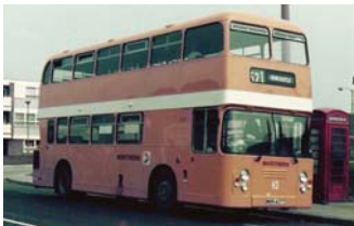
MMK060 - 1978 ECW Normal Height Single Door Double Deck