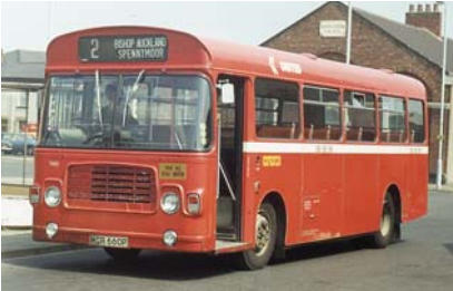
MMK602 - 1:50 Scale ECW Bristol LH Normal Length Cruved Screen