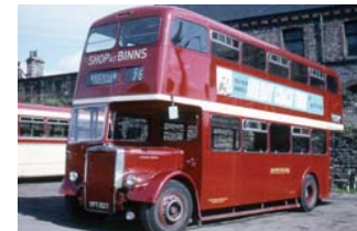
MMK077 - MCW Orion H72R 30ft (A) AEC Regent V, (L) Leyland Exposed