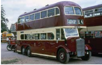
MMK047 - 1939 Northern Counties AEC Renown