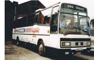
MMK071 - Plaxton Paramount 3500 Coach Door 12m