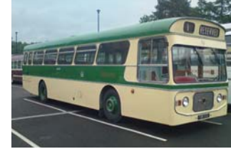
MMK074 - Strachan Leyland Panther