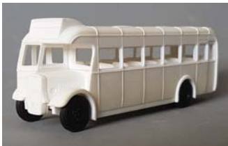
MMK057 - 1949 ECW B35R Standard Length Single Deck Bus