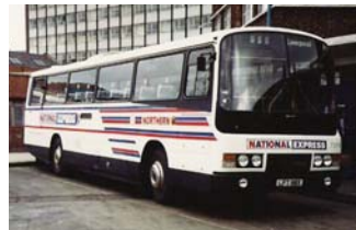
MMK059 - 1982 ECW B51 Leyland Leopard Coach