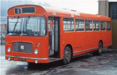
MMK606 - 1:50 Scale 1971 Bristol RESL Single/Dual Door Option