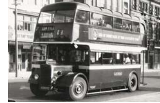
MMK075 - Park Royal H56R 8ft (A) AEC Regent III, (G) Guy Arab