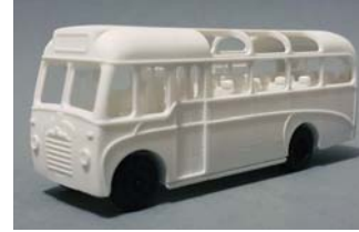
MMK069 - Duple Bedford C5 MacBraynes Bus/DP