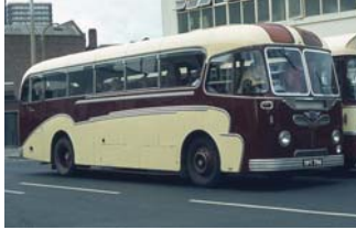
MMK051 - 1958 Roe Dalesman C41C Coach