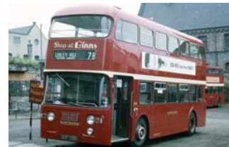
MMK073 - Alexander A-Type Leyland Atlantean / Daimler Fleetline. Please specify front / bustle: (A) Early Single Headlamp; (B) Early Dual Headlamp; (C) Late Oval Surround; (L) Leyland Atlantean; (F) Daimler Fleetline