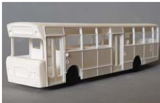
MMK061 - 1968 Marshall Camair Leyland Panther