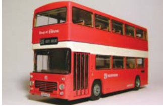
MMK009 - Willowbrook Bristol VR (Re-Run)