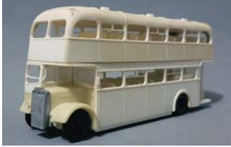
MMK017 - Alexander 30ft Lowbridge Open Platform