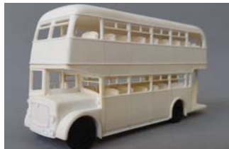
MMK058 - 1954 Park Royal H61R/RD Sloping Front