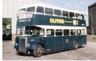
MMK053 - 1958 Burlingham H73RD Leyland PD3