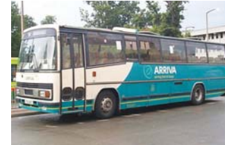
MMK070 - Plaxton Paramount 3200 Grant Door 11m