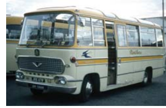
MMK063 - 1970 Duple C29F Bedford VAS Vista 25 Coach