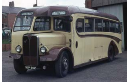
MMK607 - 1:50 Scale 1947 Burlingham Coach (A)AEC Regal / (L)Leyland PS I

Kits are limited runs, pre-order now to avoid missing out!