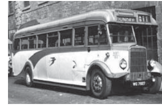
MMK064 - 1938-39 Alexander B39F Leyland Cheetah