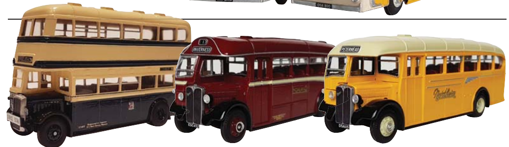
MMK042 - 1937-40 MCCW Birmingham Std. Daimler COG5