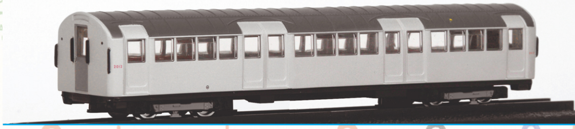
Non Driving Motor Car numbered 2012