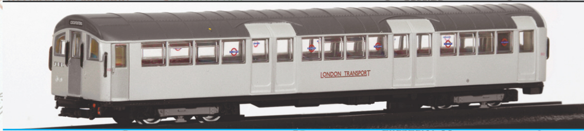
'D' Carriage numbered 1013