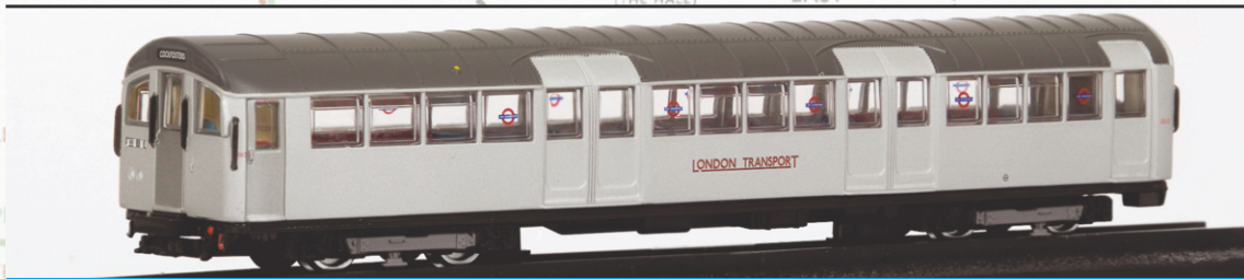
'A' Carriage numbered 1012