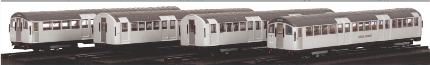
99936 1959 Four Car London Tube Set PICCADILLY LINE