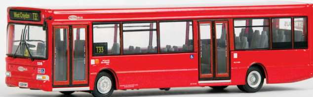
36602 SLF Dart MkII 2 Door METROBUS The unbroken red livery of Metrobus applied to our series 2 SLF Dart makes a pleasant change from some of the more colourful livery creations we see. Fleet number 328, registered V328 KMY is working route T33 to West Croydon. DECEMBER RELEASE.