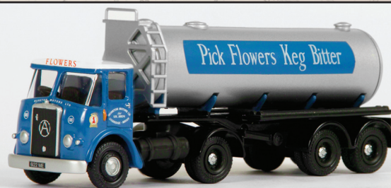
37401 Atkinson Articulated Tanker MONKTON MOTORS LTD 'FLOWERS KEG BITTER' Our Articulated Atkinson Tanker carrying Flowers Keg Bitter was operated by Monkton Motors Ltd who handled many Beer deliveries for Whitbread. Fleet number 118, registered 6122 ME will make a fine addition to any model collection. NOVEMBER RELEASE.