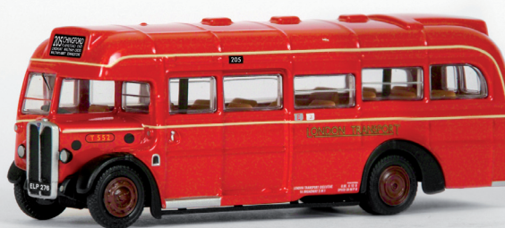
30006 AEC 10T10 Bus LONDON TRANSPORT In red London Transport livery, registration number ELP 276 is captured in 1953 on the last day of service for the 10T10. Based at Enfield Garage T 552 works route 205 to Chingford via Flamstead End, Waltham Cross and Waltham Abbey. DECEMBER RELEASE.

If you have difficulty obtaining our models please call our sales team on - 020 8344 6720 Keep up to date with all our model release information by joining our Subscription Service for an annual fee of £8.00 (U.K.) or £15.00 (Overseas) Send cheques or UK Postal Orders payable to Gilbow Holdings Ltd