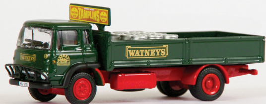
24106 Bedford TK 2 Axle Dropside WATNEYS 'TAMPLINS' Brewery related vehicles are popular with a wide range of model enthusiasts and this Watneys drey should please many. Registered HNJ 975V, fleet number 63 is branded for Tamplins Ales. NOVEMBER RELEASE.