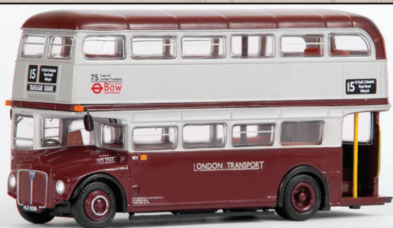
31505 RM Routemaster Bus PLATINUM EAST LONDON In 2008 East London repainted RM 1933 into a livery of platinum and Indian red to mark the 75th Anniversary of Bow Garage. Based at Bow Garage registration number ALD 933B is seen working heritage route 15 to Trafalgar Square, catch this bus while you can. DECEMBER RELEASE.