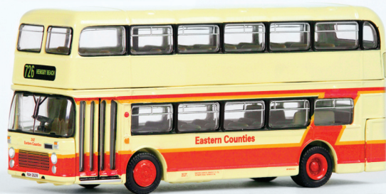
20450 Bristol VR8II EASTERN COUNTIES This Eastern Counties Bristol VR is a very special model indeed as it marks the fiftieth release of our VR8II casting, which is some achievement. Registered RAH 262W, fleet number 262 works route 726 to Hemsby Beach. DECEMBER RELEASE.