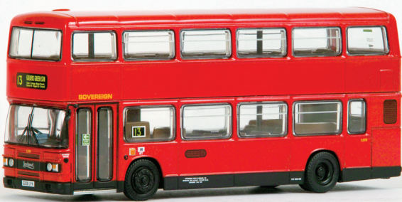
29625 Leyland Olympian SOVEREIGN BUSES The Sovereign bus fleet in London has not featured in our range to date except for a Routemaster, so this Olympian should be well received by many. Registered G308 UYK, fleet number L308 operates route 13 to Golders Green Station. DECEMBER RELEASE.