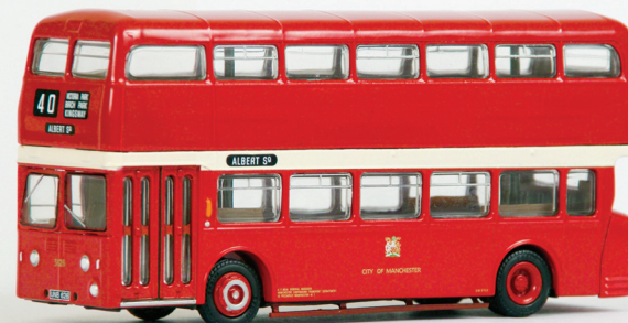
16532 Leyland Atlantean CITY OF MANCHESTER Registered UNB 626 this bus was from a small batch of Atlanteans, unusual in the fleet and will add variety to the Fleetlines previously modelled. Numbered 3626 it is working route 40 to Albert Square. NOVEMBER RELEASE.